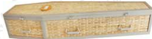
Premium Bamboo* £720