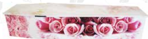
Reflections – Personalised Picture Coffins Choose from a ready-made design or design your own £920