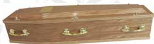
Worcester – Oak Veneer (also available in Mahogany) £595