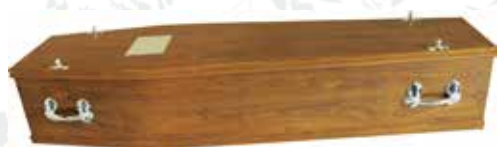
York – Oak Effect Foil Veneer £445