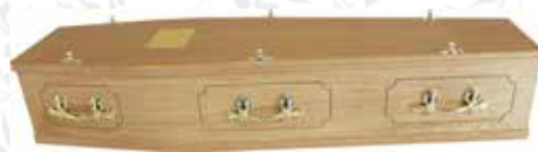
Rochester – Oak Veneer £520