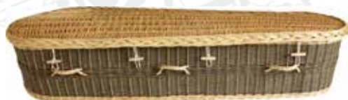
Personalised English Willow (Wicker) Hand-woven in Somerset, personalised to your specification £1,120