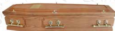
Westminster – Solid Oak (also available in Mahogany) £865