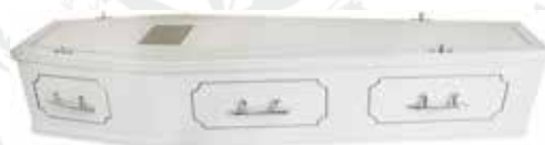
Oxford White – White Painted Veneer (also available in a range of colours - £720) £670