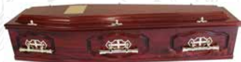
Windsor – Semi-Solid Mahogany (also available in Oak) £720