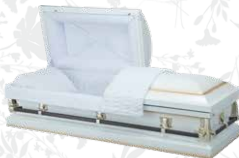
American-Style Caskets* American-style Caskets are available in wood or metal in a wide selection of designs From £1,470