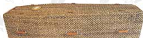
Banana Leaf – Coffin shape* (also available in Casket shape*) £995