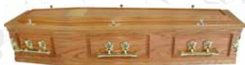
Surrey – Solid Oak (also available in Mahogany) £845